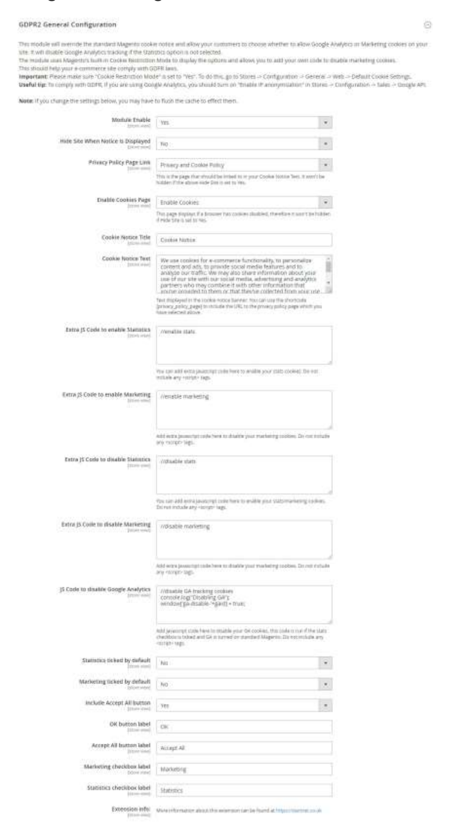
Page 7 of 8